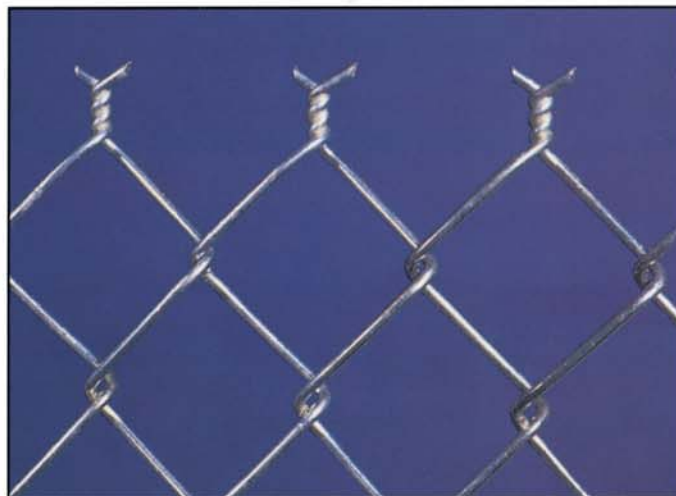
Right: GAW fabric. The GAW process guarantees that cut ends will be coated with the same quality material and protection as the rest of the fabric. The pre-coated process provides no such guarantee.