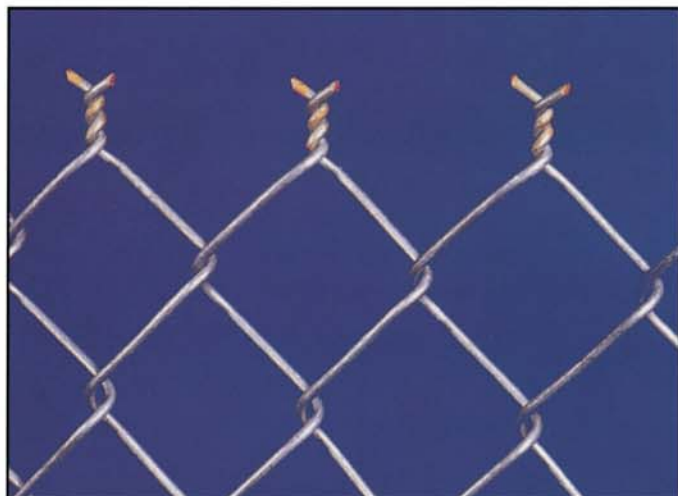
Left: Precoated fabric with uncoated tips. With pre-coated fabric some manufacturers coat the bare cut-ends, but many don't. No one coats the ends with the same material that protects the rest of the fabric.